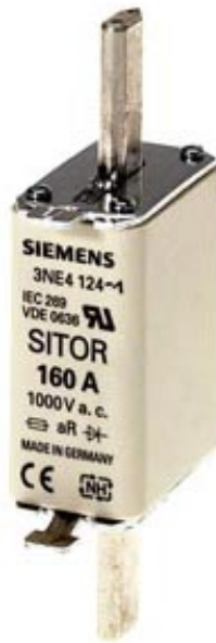
SITOR FUSE-LINK 160A, AC 1000V (DIN 43620, SIZE 0)